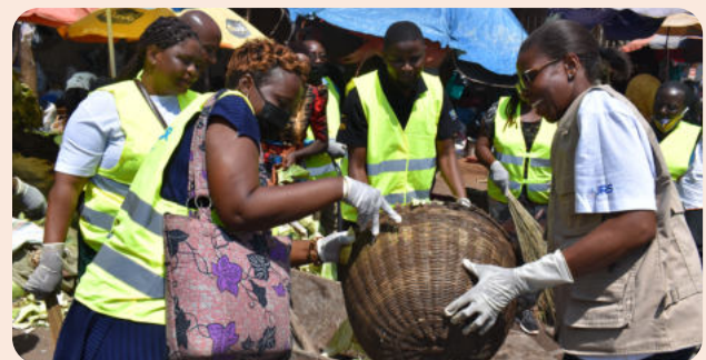
June 25, 2024, Kampala. Re:BUiLD staff, Kampala City Council Authority (KCCA) and other partners take part in a cleaning exercise at Owino Market, the largest market in downtown Kampala.