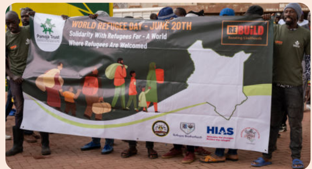
June 20, 2024, Nairobi. Re:BUiLD Partners, refugees and the host community march to Dandora Stadium, Nairobi to kick off this year's World Refugee Day celebrations.

In closing, I would like to express my heartfelt gratitude to each member of the Re:BUiLD Program, our research partners, IRC colleagues, and our colleagues at the IKEA Foundation. Your unwavering dedication and hard work are making a difference in the lives of those we serve. I am excited about the opportunities that lie ahead.