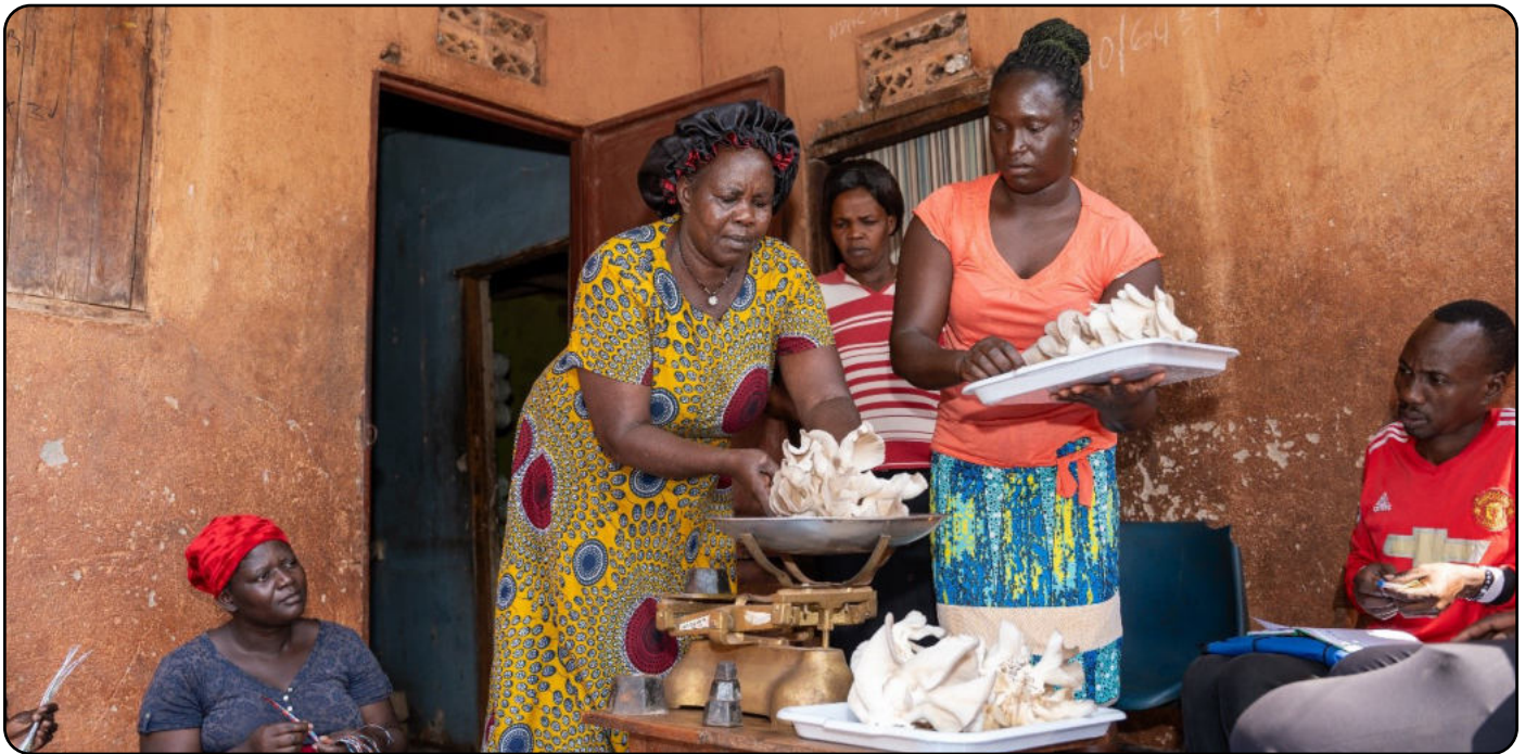
June 18, 2024, Kampala Uganda. Members of the Canan Women's Group weigh the mushrooms they harvested.