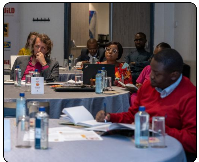
March 6th 2024, Nairobi. Donors participating in the Donor Breakfast Meeting to discuss the challenges faced by refugees and strategies to enhance their assistance.

Donors expressed appreciation for the insights provided during the meeting and pledged their support toward addressing policy gaps and program implementation challenges. They emphasized the importance of engaging in national advocacy efforts led by local governments and RLOs, with a focus on overcoming specific obstacles to refugee inclusion. Furthermore, the donors called for private sector involvement and bridging the gap between policy formulation and implementation.