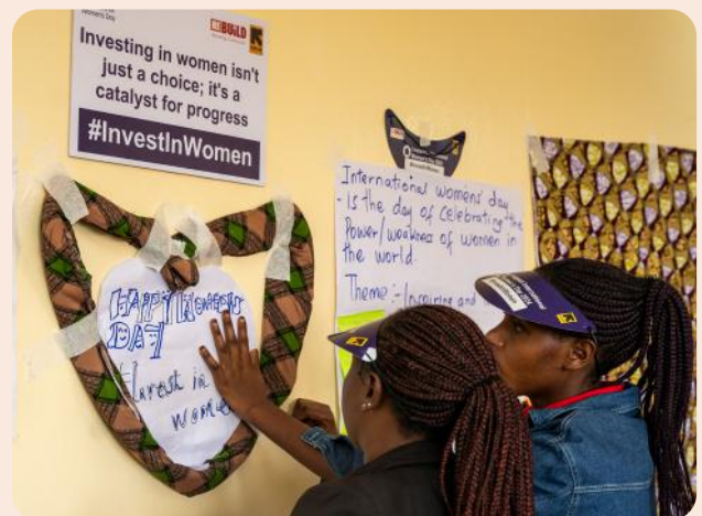
March 6, 2024 Nairobi. Re:BUiLD clients (refugees and host communities) displaying some of the group work that they had done to reflect on the theme of this year's International Women's Day at Kenya Christian Industrial Training Institute (KCITI).

I would like to express my heartfelt gratitude to each member of the Re:BUiLD Program, our research partners, IRC colleagues, and our colleagues at the IKEA Foundation. Your unwavering dedication and hard work are making a difference in the lives of those we serve.