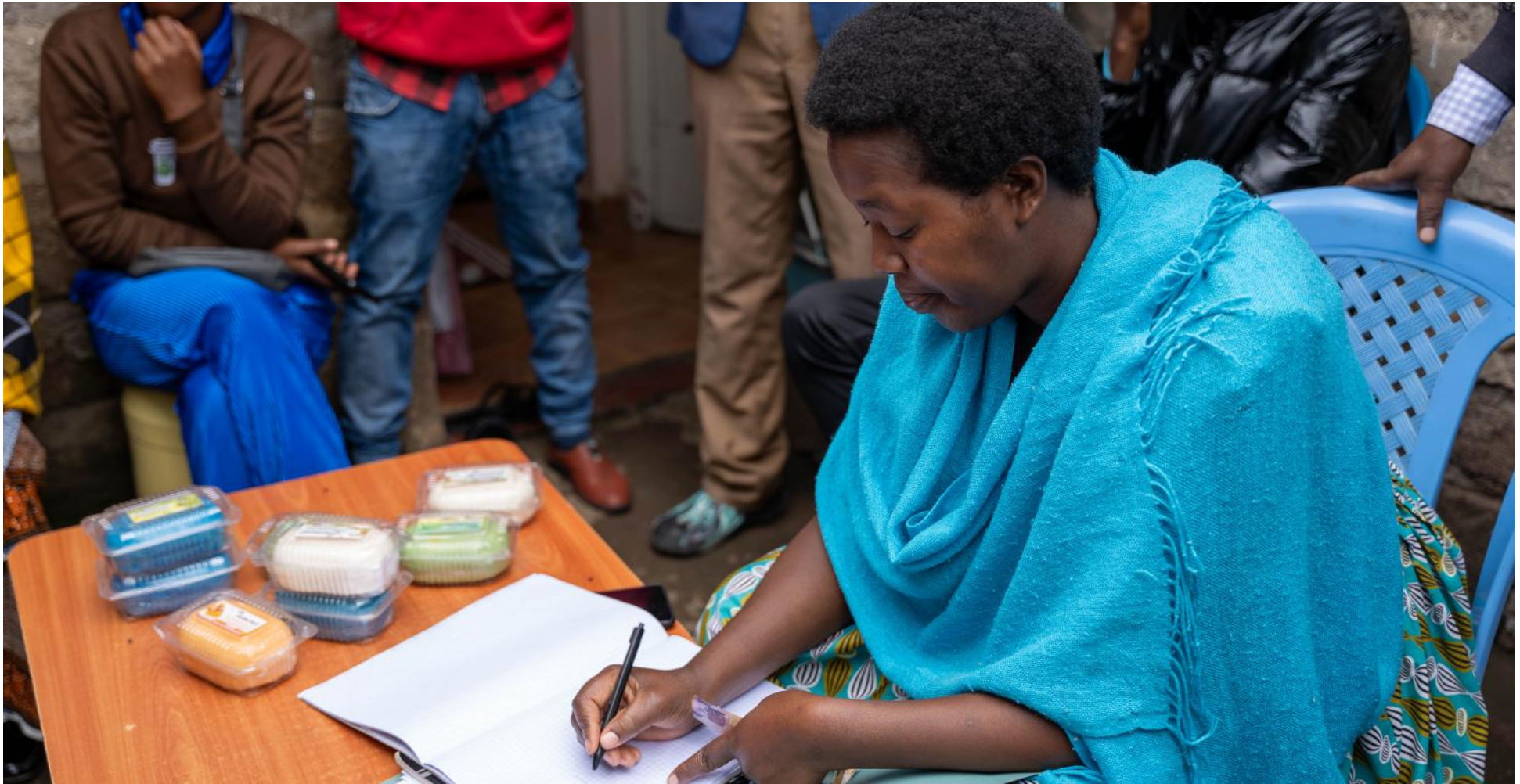
31 October 2023, Nairobi. The treasurer of Tujijenge Mulenge USA Group notes down the savings of the week. Tujijenge Mulenge is one of the groups that have been able to access fintech through IRC's partnership with Equity Bank in Nairobi