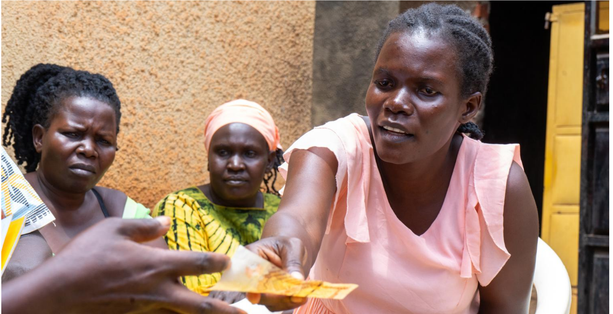
24 August 2023, Kampala. Members of God's Love USLA Group take part in a saving session in their weekly meeting. God's Love USLA group is one of the groups that have been able to access fintech through IRC's partnership with Ensibuuko - a micro-finance institution in Kampala