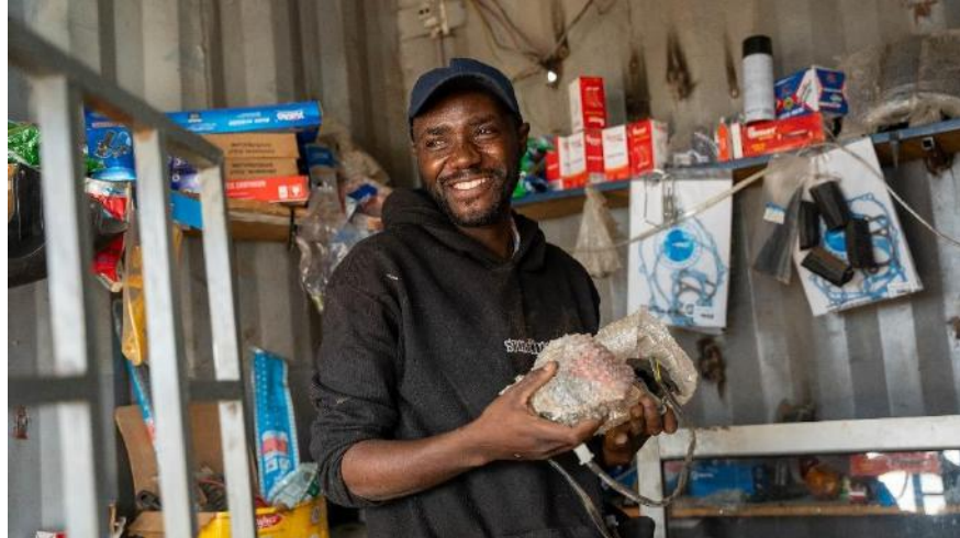
As a business grant recipient, this Re:Build client started his bodaboda (motorcycle) spare parts shop in Kabiria, Kenya.