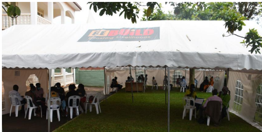
Figure 3.1. Mentorship groups participate in their first meetings at the Livelihoods Resource Center during piloting

that their needs are often larger than those of mentees (e.g. larger families) even if their businesses are doing slightly better. After discussing the reasons for the disparities, mentors often suggested that they should get at least half of what their mentees are receiving.