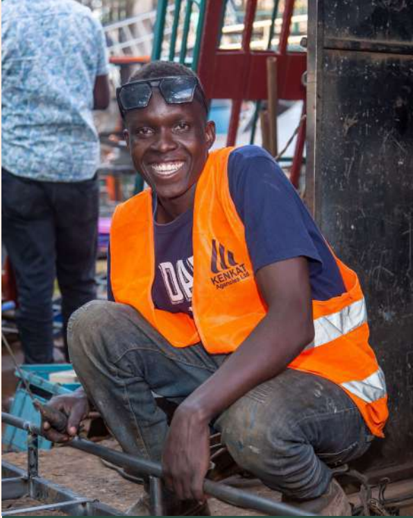
A South Sudanese refugee under a Re:Build apprenticeship placement to improve skills in welding.