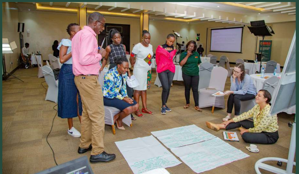
A group discussion during the Programme Learning Conference

program implementation. The planning meeting brought together teams from Kampala, Nairobi, and New York. Recommendations from the meeting fed into the planning for the third year of the Re:Build program.