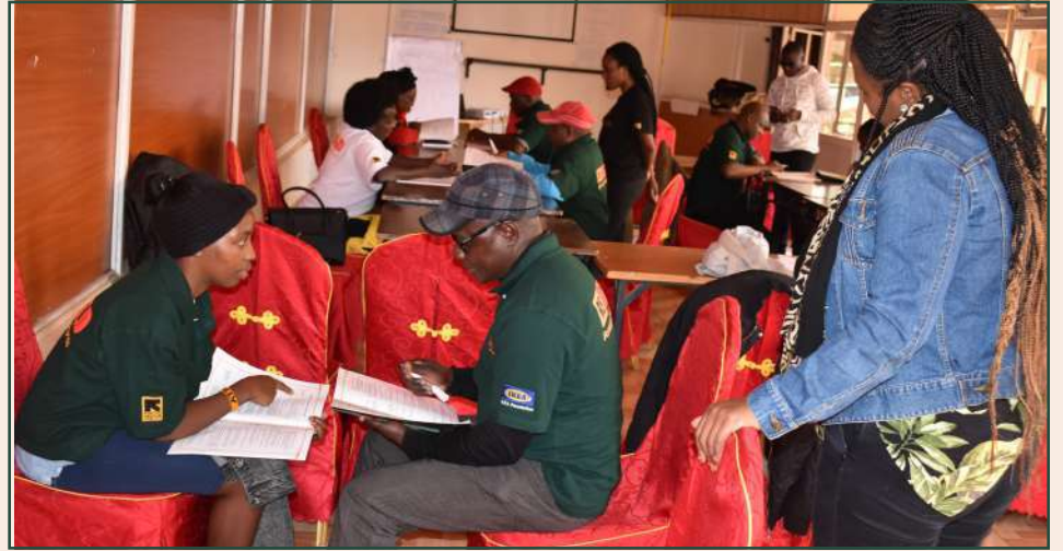
Left: Mentors during a training session in Kawangware, Nairobi (Right) an IRC staff with mentees during an information session

A Randomized Control Trial (RCT) involving 4,000 aspiring micro entrepreneurs and mentors in Nairobi, Kenya was launched September 2022.