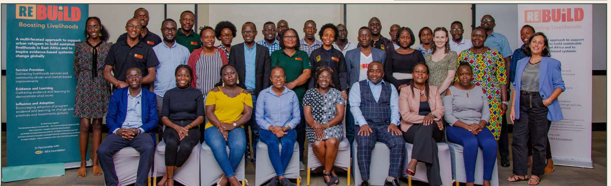
Re:Build team at the Program Planning Conference held in August in Kampala

R efugees in East Africa: Boosting Urban Innovations for Livelihoods Development (Re:Build) is a five-year urban livelihoods program being implemented in Nairobi and Kampala. Re:Build seeks for urban refugees and vulnerable host residents to achieve economic, regulatory, and social environments. The program is committed to generate and share evidence for innovative, sustainable livelihoods solutions that can be adopted to support refugees and vulnerable host residents in other cities in East Africa and beyond. The International Rescue Committee and the IKEA Foundation are working with local authorities, local and international partners, Community Based Organisations and Refugee Led Organizations to deliver program interventions.