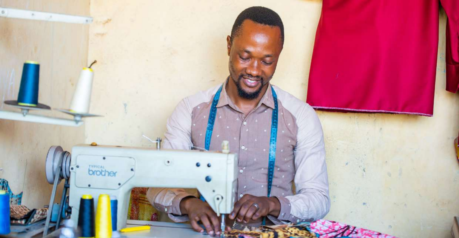
A refugee tailor at work in Kampala. The textiles sector is a popular livelihoods activity among refugees and hosts in Kampala and Nairobi.