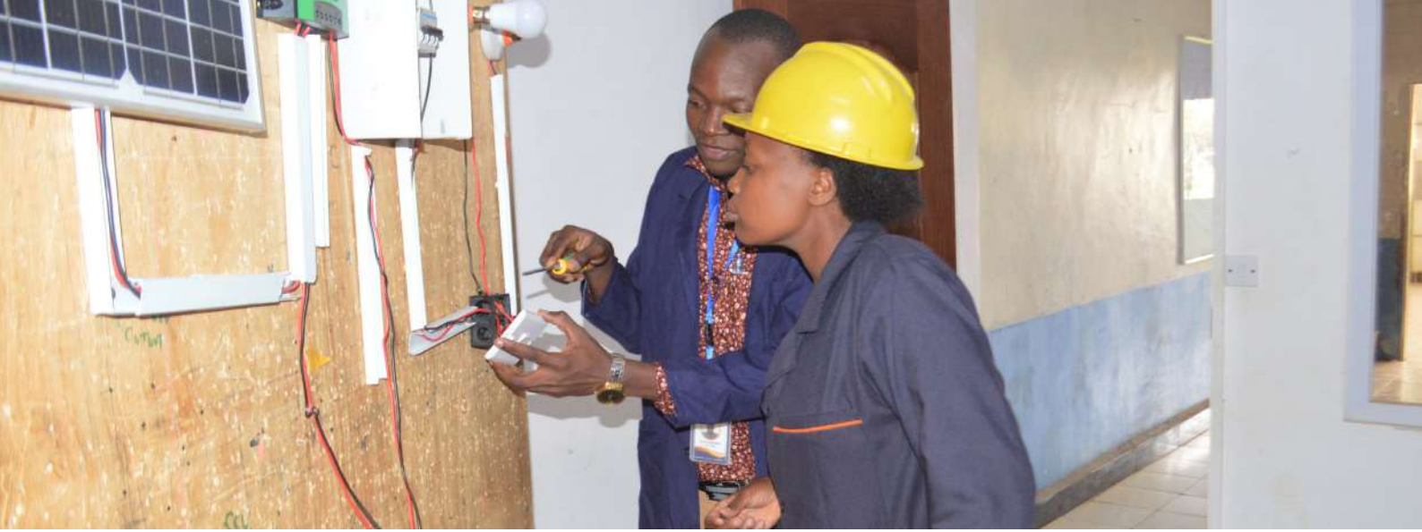
E-waste disposal, Nairobi, Kenya.