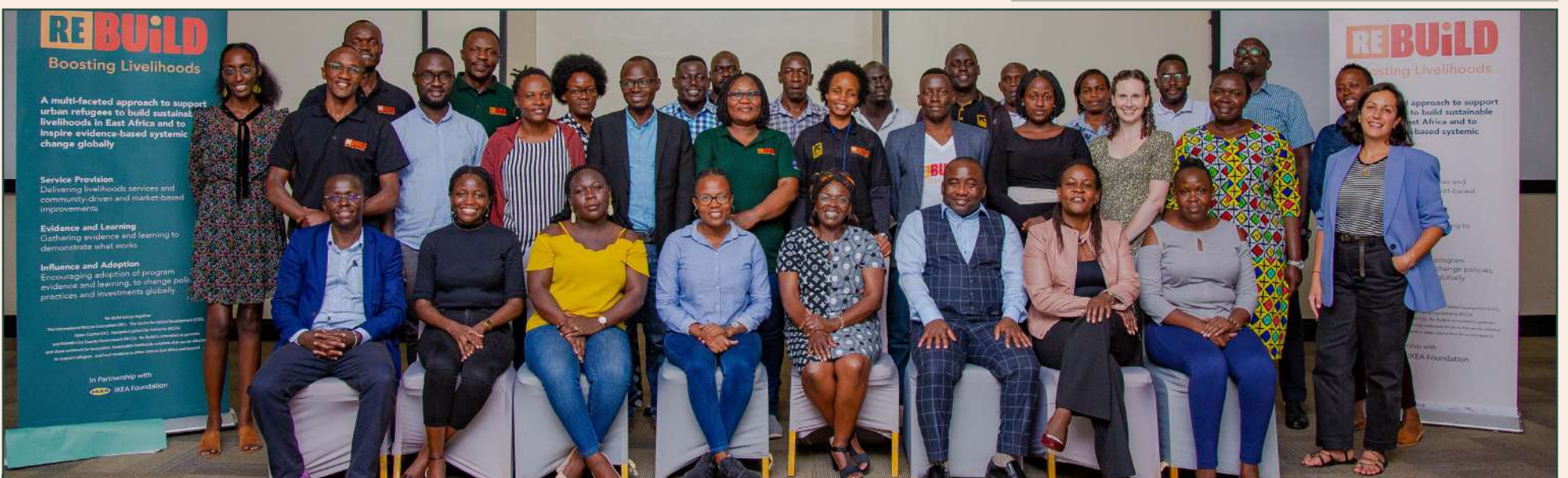
Re:Build team at the Program Planning Conference held in August in Kampala

R efugees in East Africa: Boosting Urban Innovations for Livelihoods Development (Re:Build) is a five-year urban livelihoods program being implemented in Nairobi and Kampala. Re:Build seeks for urban refugees and vulnerable host residents to achieve economic, regulatory, and social environments. The program is committed to generate and share evidence for innovative, sustainable livelihoods solutions that can be adopted to support refugees and vulnerable host residents in other cities in East Africa and beyond. The International Rescue Committee and the IKEA Foundation are working with local authorities, local and international partners, Community Based Organisations and Refugee Led Organizations to deliver program interventions.