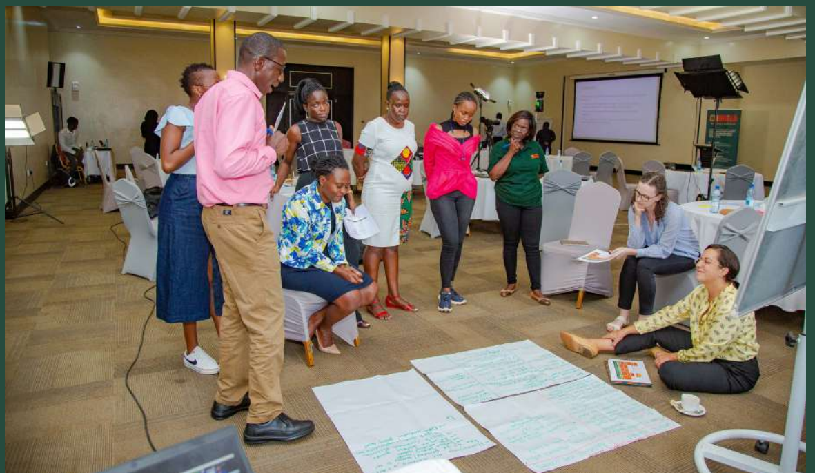
A group discussion during the Programme Learning Conference

program implementation. The planning meeting brought together teams from Kampala, Nairobi, and New York. Recommendations from the meeting fed into the planning for the third year of the Re:Build program.